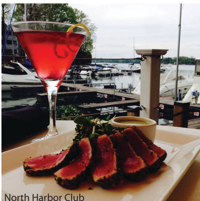
North Harbor Club