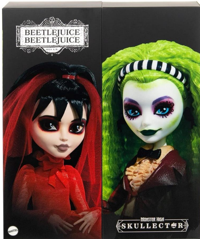
Front Panel of Package